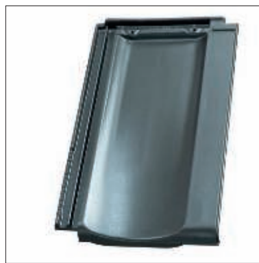
Fig. 1 Roofing tile Continental 9 produced by Wienerberger doo Kanjiza

Bongioanni Stampi made further dedicated studies, to ensure the mounting possibility on the presses of both new and existing mould-tools. This was achieved through cross-checks with Bongioanni Macchine's Technical Department, who can perform 3D simulations of the forming process. As a result of this, the Italian plant supplier had to develop specifically-dedicated equipment. Bongioanni succeeded doing that, thanks to the long experience of its two companies Bongioanni Stampi and Bongioanni Macchine as well as the synergy given by the possibility of easily combining the capabilities of the respective technical departments that, despite being distinct, are part of an unique company – a peculiarity that remained unique in the heavy clay ceramics branch – to the full benefit of the projects idealised from time to time by its customers. Beside the main roofing tiles, Bongioanni Stampi supplied the mould-tools for their