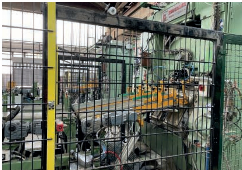
Fig. 3 Clay bat feeding supplied by Bongioanni Macchine

fittings, which are a natural compendium for the marketing and the execution of a high-quality roofing product, composed by: start glatki ridge tile, end ridge tile, ventilation tile, half twist tile as well as right and left gables.