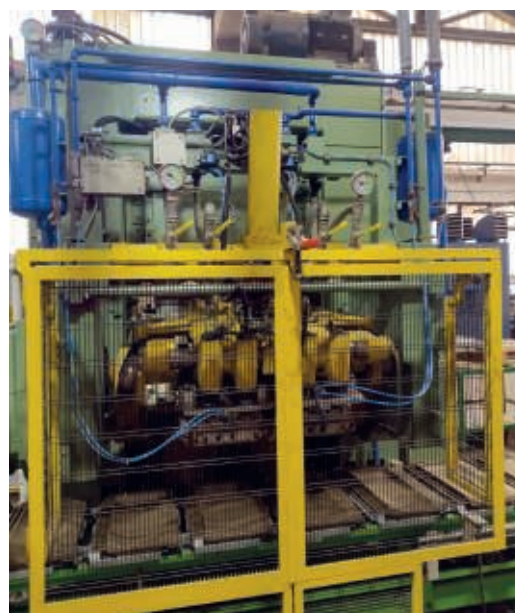
Fig. 5 Visible suction heads of the press supplied by Bongioanni Macchine

the machines to receive bigger mould-tools. Under this goal, Bongioanni carried out a modification on the bat loading line, supplying the following elements: