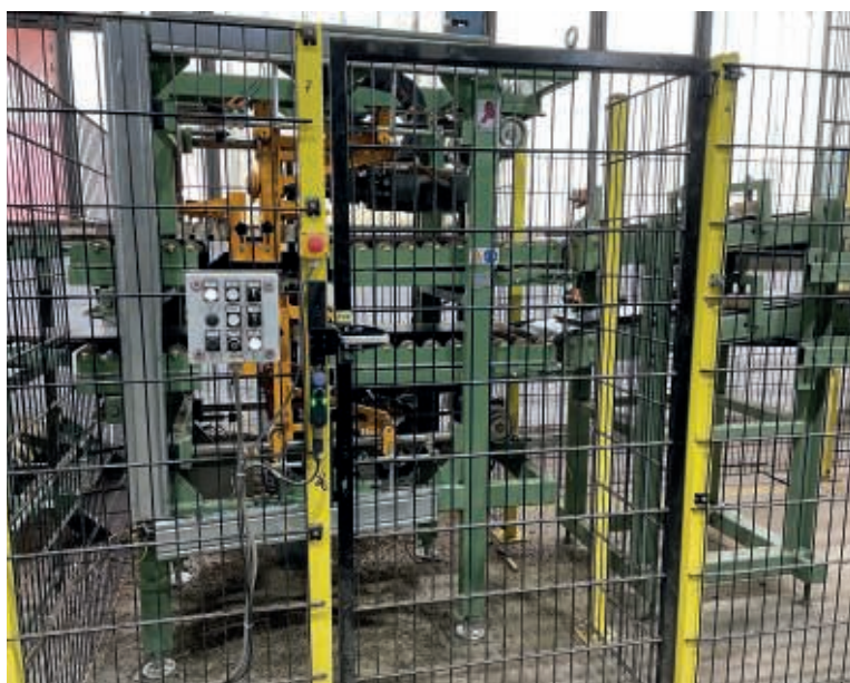
Fig. 4 Cutter supplied by Bongioanni Macchine